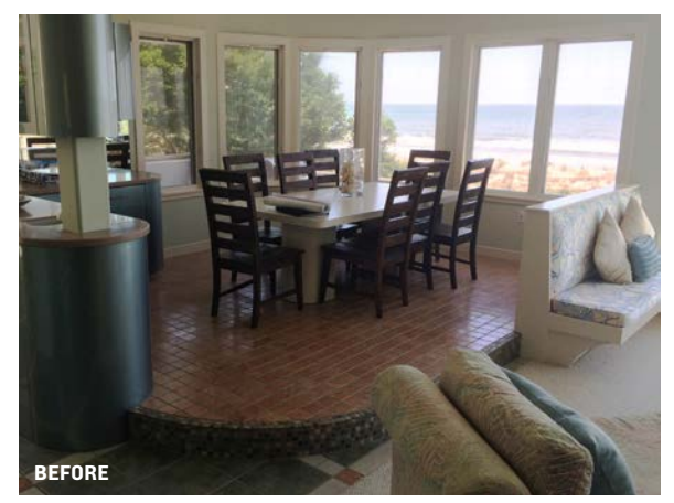
An elevated floor with steps in the dining room was leveled.

The home's primary living space is on the second floor, where the master suite, kitchen, great room and living room take advantage of the unblemished view of the ocean beyond the property's 90 feet of waterfront. To take full advantage of the space, the team improved the flow in the kitchen, dining room and the great room, removing a fireplace in the process.